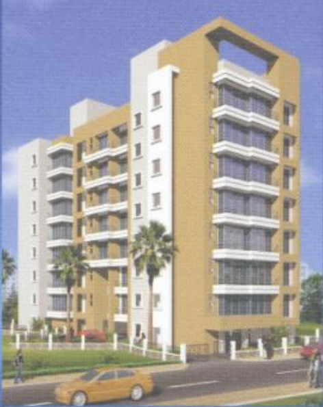
Fressia II - Dahisar (W)