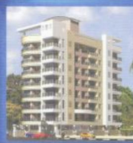
Shree Shiv Shakti - Borivli (W)