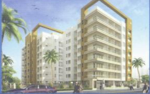
Fressia III - Dahisar (W)