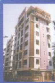
Shiv Shakti - Borivli (E)