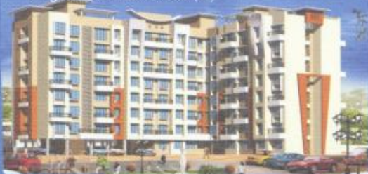
Kingstone Annex - Vasai (W)